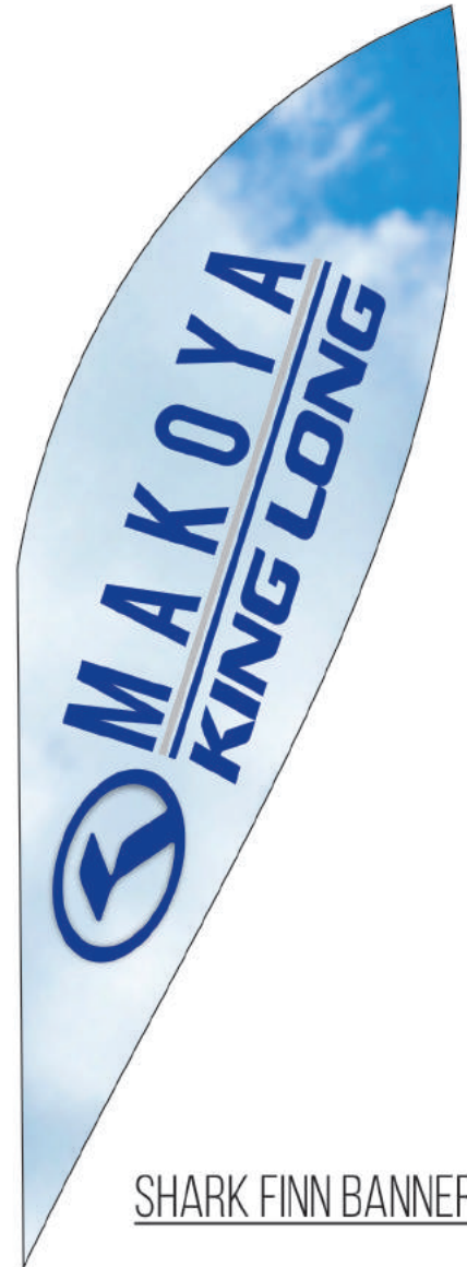
SHARK FINN BANNER